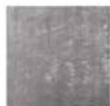
7 DIBBETS RUG CM 400X300