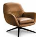
6 JENSEN ARMCHAIR CM 81X85 H78